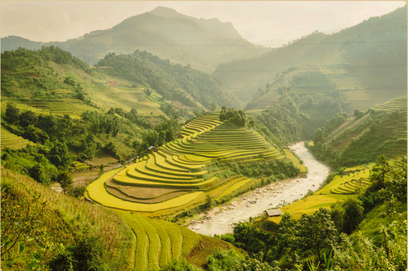
Rice terraces in Ha Giang, Northern Vietnam.

They are simply following different communication rules. As Vietnam becomes more connected to the world, communication styles continue to evolve. Younger generations are often more comfortable expressing disagreement openly than their parents or grandparents. Yet the instinct to soften difficult messages remains surprisingly strong. Not because Vietnamese people dislike honesty. But because many believe that how something is said can be just as important as what is said. For many Vietnamese, communication is not only about exchanging information. It is about managing relationships. In Vietnam, words do more than deliver a message. They also protect a relationship.