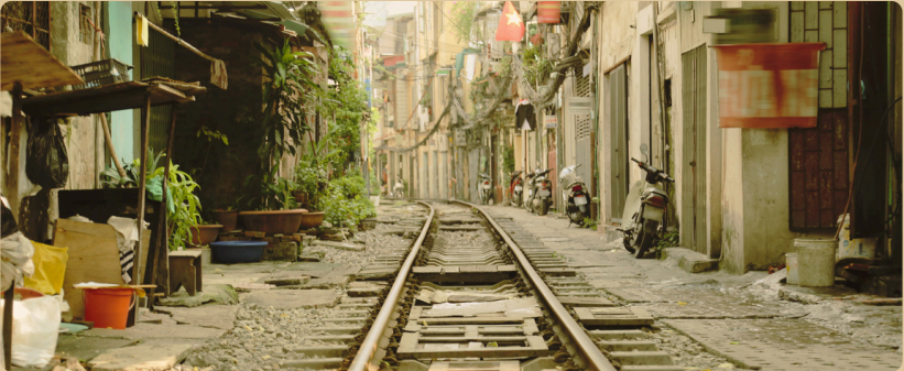
Hanoi train street, Vietnam

The hometown remains familiar, yet never exactly the same. For many Vietnamese people living abroad, this creates a feeling that is difficult to describe. Part of their heart belongs to where they came from. Part belongs to where they are now. They learn to live between places. Between languages. Between versions of themselves. Yet despite this complexity, many continue carrying home with them. Not as a physical place. But as something woven into who they are. Perhaps that is why so many Vietnamese people continue calling home regularly, even after years abroad. Why they search for Vietnamese restaurants in unfamiliar cities. Why they smile when they unexpectedly hear their language in a foreign country. Why certain songs can still make them emotional decades later. Home travels farther than geography. It follows people across oceans. Across borders. Across entire lifetimes. And perhaps that is the lesson many Vietnamese discover after leaving. You can leave home. But home rarely leaves you.