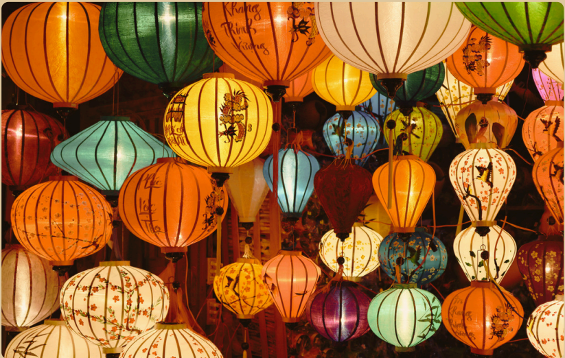
Hoi An Ancient Town, Central Vietnam.

Sometimes, it simply means carrying your family with you, wherever you go.