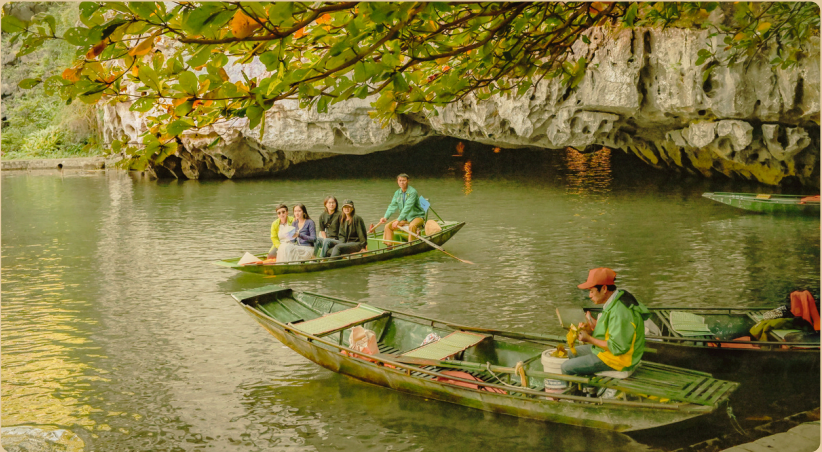
Boat ride in Trang An, Vietnam

It is a quiet way of preparing for tomorrow.