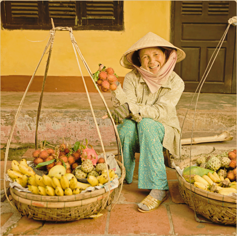
A Vietnamese street fruit vendor

Not because it provides answers. But because it gives people a way to talk about the mysteries that remain. Some become family. Some become friends. Some become lovers. Some remain only memories. Yet all of them, in one way or another, become part of who we are. And perhaps that, too, is duyên.