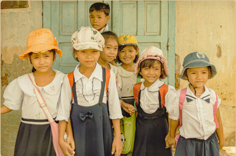
Vietnamese primary school students

Sometimes, it becomes another form of family.