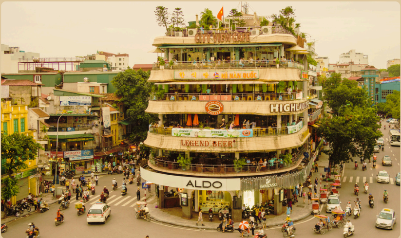
A former Hanoi landmark remembered by many locals.

And sometimes, the people who worry the most are the people who care the most.